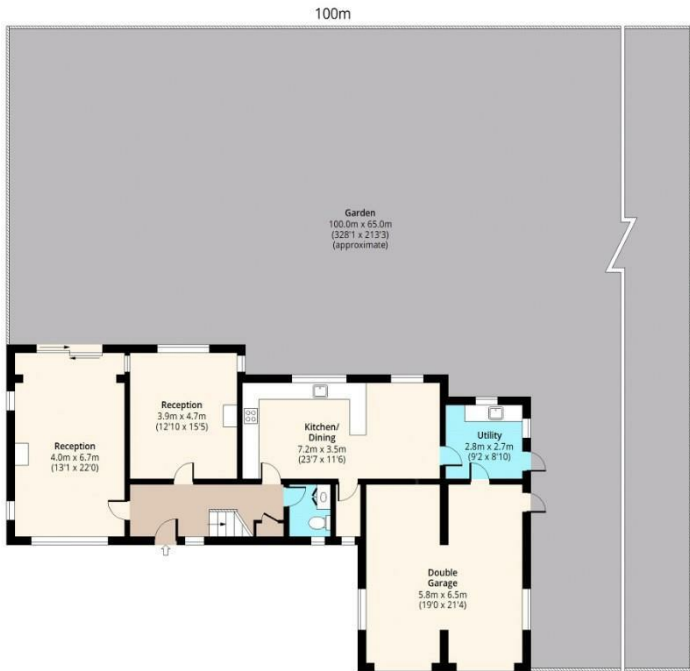
Ground Floor Approx. 136.28 Sq. meters (1467 Sq. feet)